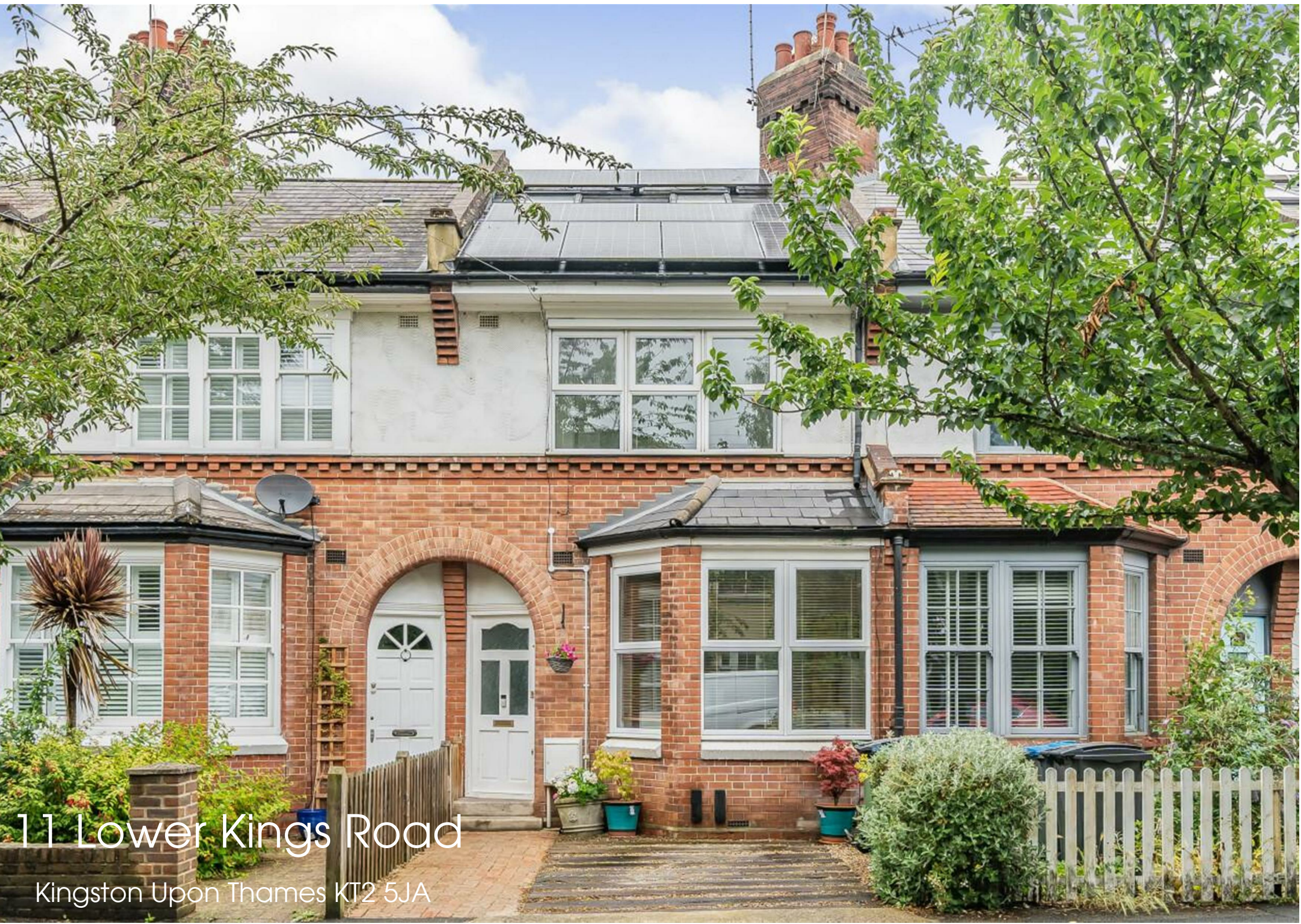
11 Lower Kings Road Kingston Upon Thames KT2 5JA